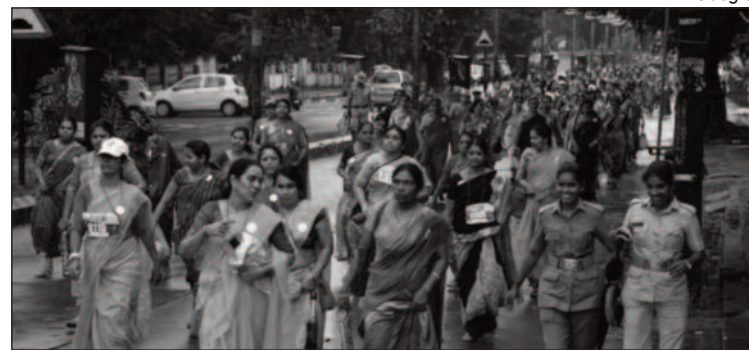
Saree walk and Run rally 2018

MANGALORE: The Saree walk and run, an awareness programme will be held at Mahatma Gandhi Park, Managudda by Medimade Solutions in association with Lions Club, JCI Club, Inner wheel club and other women's clubs on September 29 at 6 a.m.