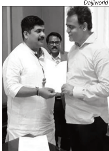
MLA hands over Rs 25 crore

A request was made with the CM to release State Finance Commission (SFC) grant for various works that need to be done in the Mangaluru city south assembly constituency area. Accordingly the CM has approved Rs 15 crore under the special grant from his discretionary fund. So in total the state government has released a grant of Rs 25 crore for the