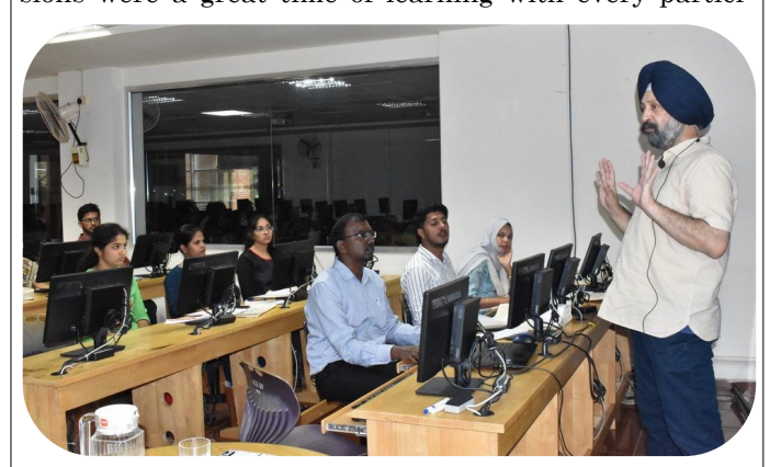
pant executing the programmes in the lab.

There were two forenoon sessions and two afternoon sessions. All the sessions were hands-on sessions. The sessions were a great time of learning with every partici-