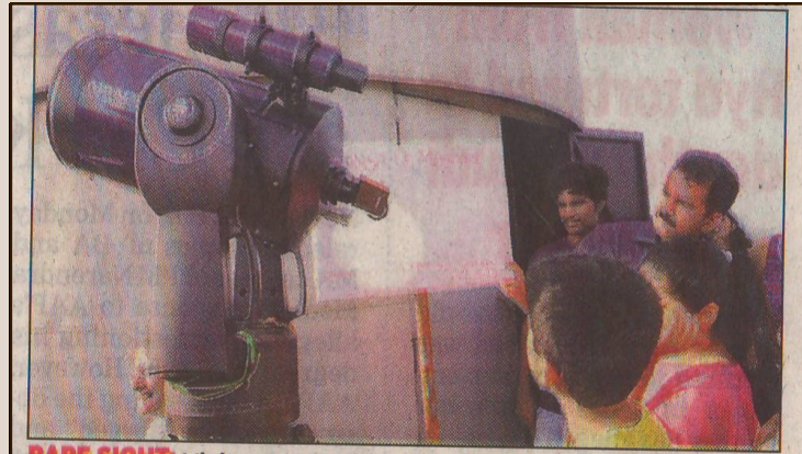
RARE SIGHT: Visitors watch the transit of Mercury at St Aloysius College on Monday. Mercury was seen as a dot on solar disc