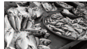
Fish from the market

As such, fish worth lacs of rupees are being destroyed every day. In the past, fish from Karwar, Tadadi and